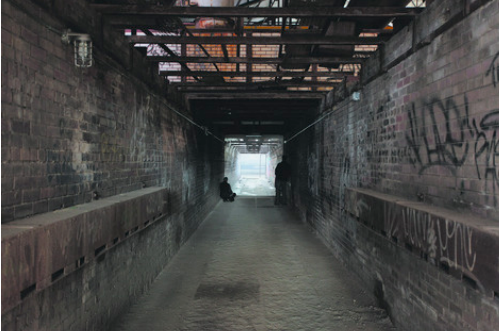
ISABELLE HAYEUR'S WHITE GOLD TRANSFORMS A TUNNEL INTO AN ENTRYWAY TO A BEACH.

FOUR DIRECTIONS at Evergreen Brick Works (550 Bayview), to December 31. 416-596-1495. NOW RATING N N N N N READER'S RATING